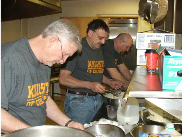
Figure 2: File Picture of some of the Kitchen Team from 2009

We will need members to assist in the set up, cooking, serving and clean up. We would also appreciate it if members, or their wives could prepare the baked goods that will be used for the desserts.