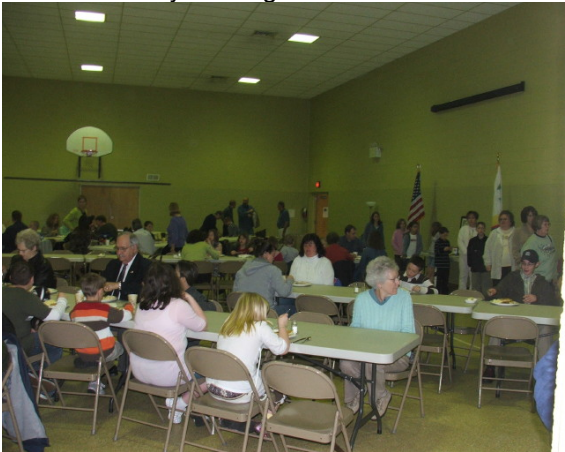
Figure 1: File Picture of one of our KofC Meals from 2009

For the third year, The Sacred Heart Knights of Columbus Council is providing meatless dinners for three Fridays during Lent for the Sacred Heart Parish community.