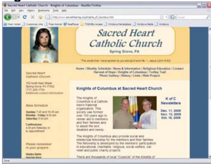
Figure 6: Current Sacred Heart KofC C Council Home Page

The website committee will integrate these new ideas with the original proposal and prepare a prioritized schedule for continuing the upgrade activity. To complete the scheduling activity, we will need the names of additional council members who would be willing to provide the initial content for the new website screens.